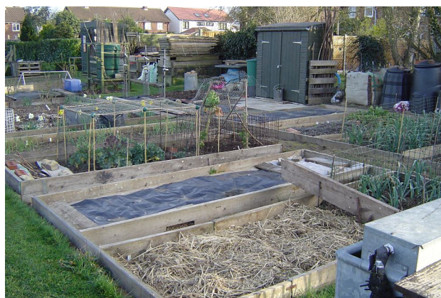
A well-run allotment

The BBC and Gardeners' World have just launched Dig In ( bbc.co.uk/digin ), providing free packets of easily-grown vegetable seeds, and showing how to grow them on the programme. Joe Swift (who lives a long way from his allotment) is continuing to review his own plot and those of his neighbours, with news of allotment gardening around the country.