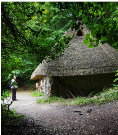
Mediaeval cottage, Hangleton

The Museum, a registered charity, rescues examples of threatened vernacular buildings from south-east England, the region which includes the Sussex and Kent Wealds and the North and South Downs. Launched in 1967, it has acquired good examples of buildings gradually and now they number forty-four.