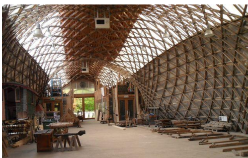
Gridshell, interior (Antony Glaser)

had mid-afternoon. Others were happy to have been caught in the tea-room; I was up at the wood yard, and swiftly hopped over a rope to shelter in the cattle shed, to watch the dripping trees.