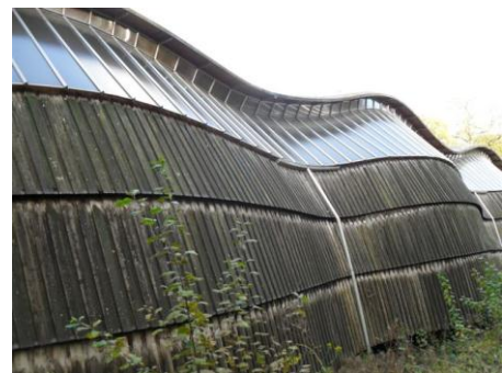
Gridshell, exterior (Antony Glaser)

Several LHS members were fortunate to be trapped here during the hour of rain we