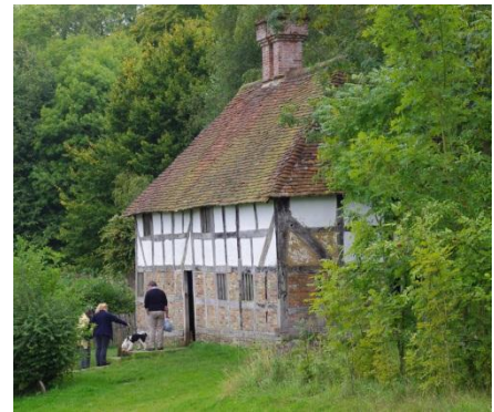
Pendean Farmhouse, Midhurst

As we emerged from the entrance building, itself a rescued farmhouse from Newington, Kent, the two main clusters of buildings were spread out before us beyond a huge expanse of grass. To the right, sloping down to the lake and mill pond, are the working buildings – sawpit, smithy, barn, and the working water mill (flour on sale in the shop); straight ahead is a cluster of imposing buildings, including a market hall from Titchfield, Hampshire; a mediaeval house from North Cray, Kent; a mediaeval shop from Horsham, Sussex; and other large buildings, some of which act as meeting and education rooms.